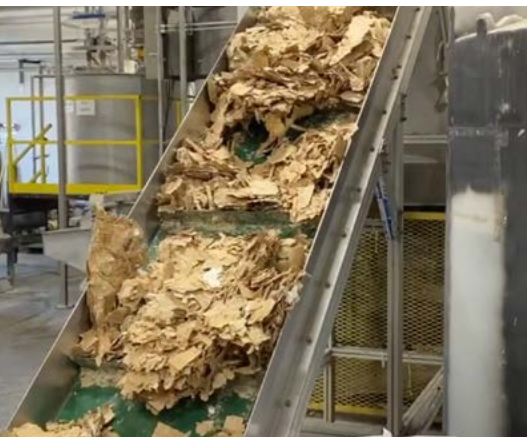
SORTED PAPER WASTE ENTERING PULPER