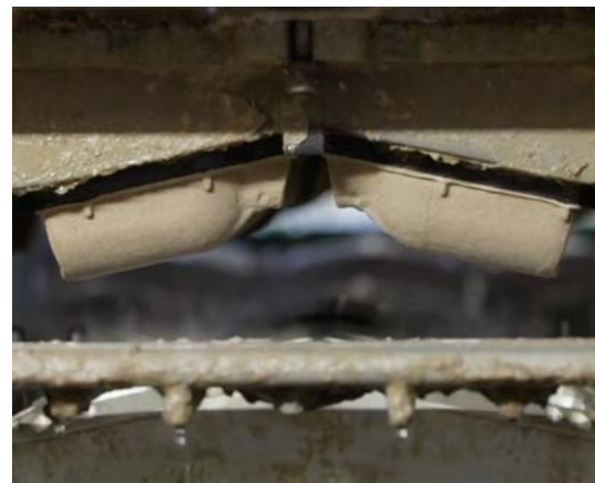
PULP TRANSFORMED INTO DESIRED SHAPE

For additional information, visit ecologicbrands.com