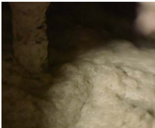
PAPER WASTE BREAKING DOWN INTO PULP FORM